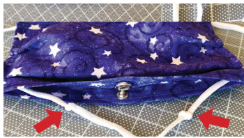
Adjustable Ear Straps

To adjust straps, untie knot and retie it to your desired length